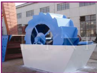
Sand Washing Machine