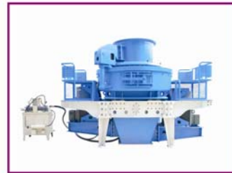
Sand Making Machine