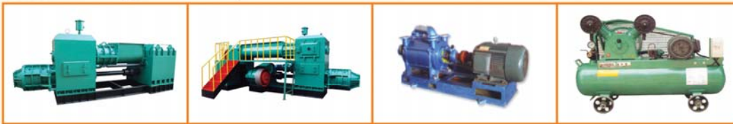
Efficient & Compact Single Stage Vacuum Extruder