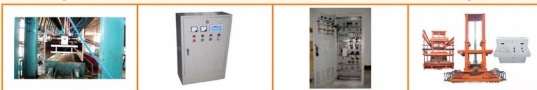
Logo Machine With Auto Brick Cutting Machine