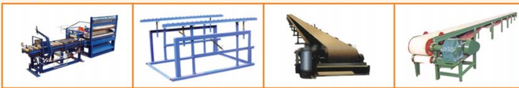
Auto Green Brick Cutter